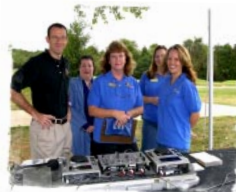
Annual golf tournament raises money for the NW High School scholarship fund.

To provide the Northwest Triad community with a cooperative organization in order to bring together businesses, professionals, commercial farming, home base businesses, artists, and any other entrepreneur business or organization to help support each other and promote community awareness. Our goal is to let the local community know that by doing business locally the merchants will provide personal assistance and exceptional customer service. It is our goal to be a voice for our respective towns, making suggestions for business changes and growth as well as play a vital role in community activities.