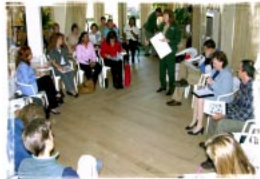
NWTM Monthly Meeting at Steeplehill Farm

Membership also allows for Co-op Advertising which keeps your company in the eye of the public. You will find our ads advertised locally in the NW Observer 2-4 times per year. And that's just the beginning!