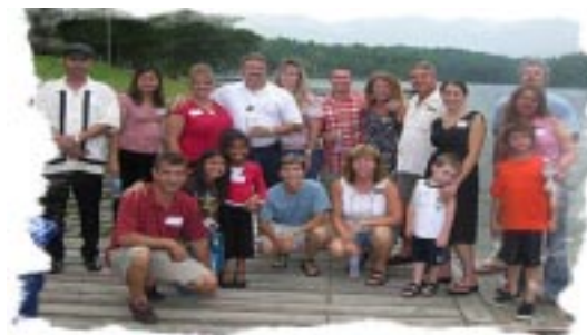
Members relax and socialize at the annual picnic.